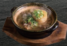
Wagyu Tendon Stew